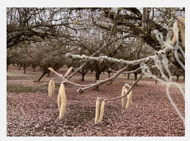
NW Native Nuts LLC, Creswelll

We are excited to launch our OOHC quarterly newsletter. It provides an opportunity to share information, resources, opportunities, and events. If you are a member, you'll receive it via email without any further action needed. Non-members can sign up for the newsletter on our website.