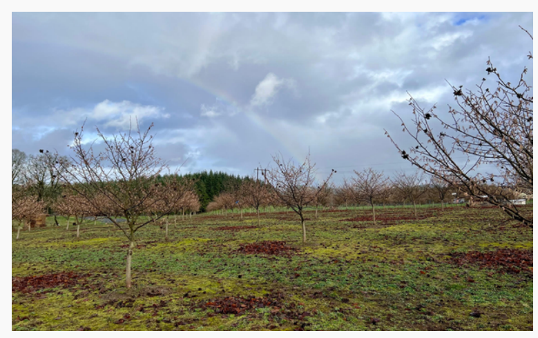
Cow Pig Dragon Farm, Yamhill

Each year we select one or more organic hazelnut orchards (or related sites) to include in the summer tour. If you have such a site, and would like to be considered as a host site for a future summer farm tour, please let us know via the website contact form, or talk directly with a member of the Advisory Committee.